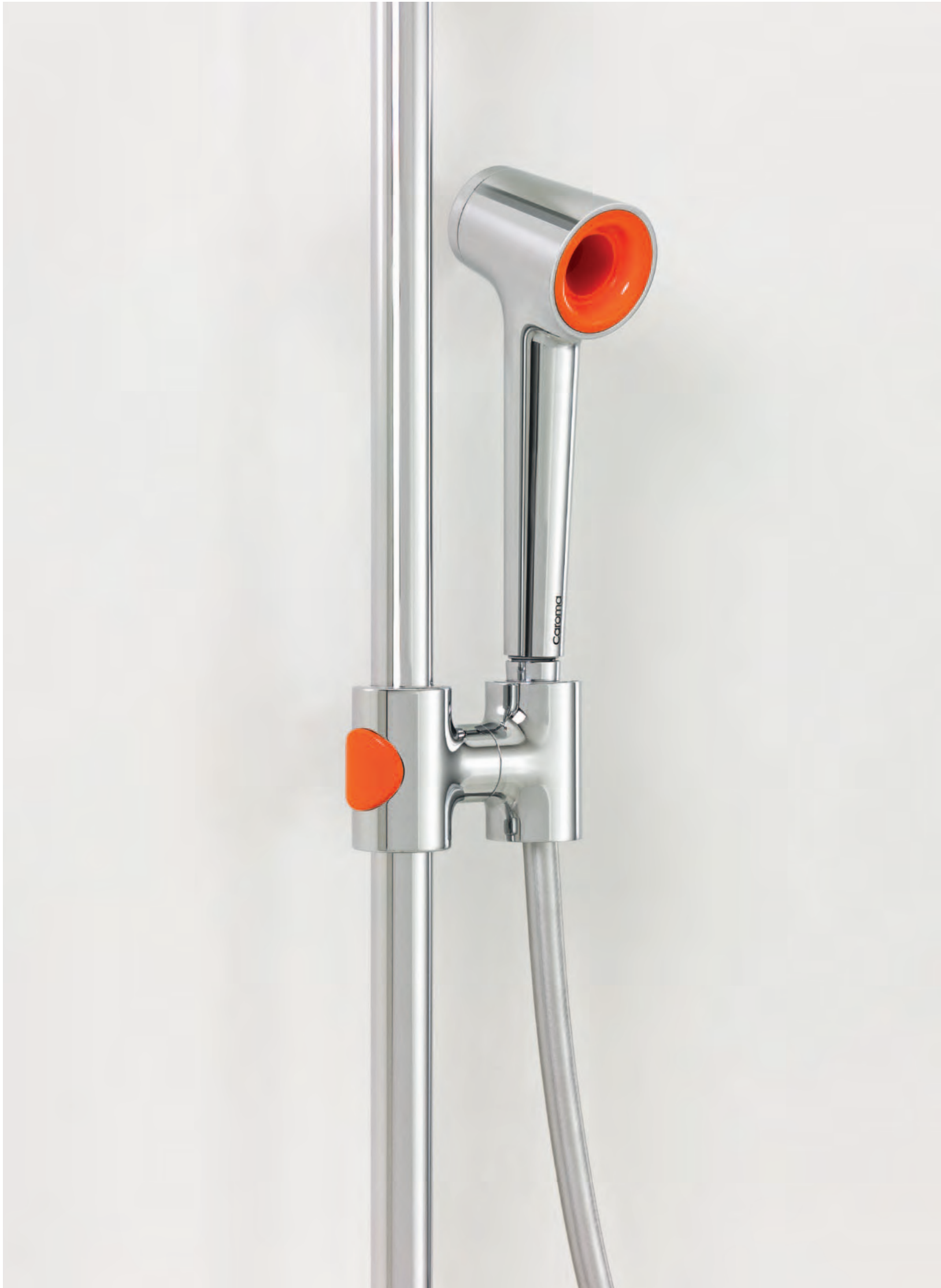
rail shower CMN92007C3A also available in chrome-white and chrome-black shower mixer sold separately