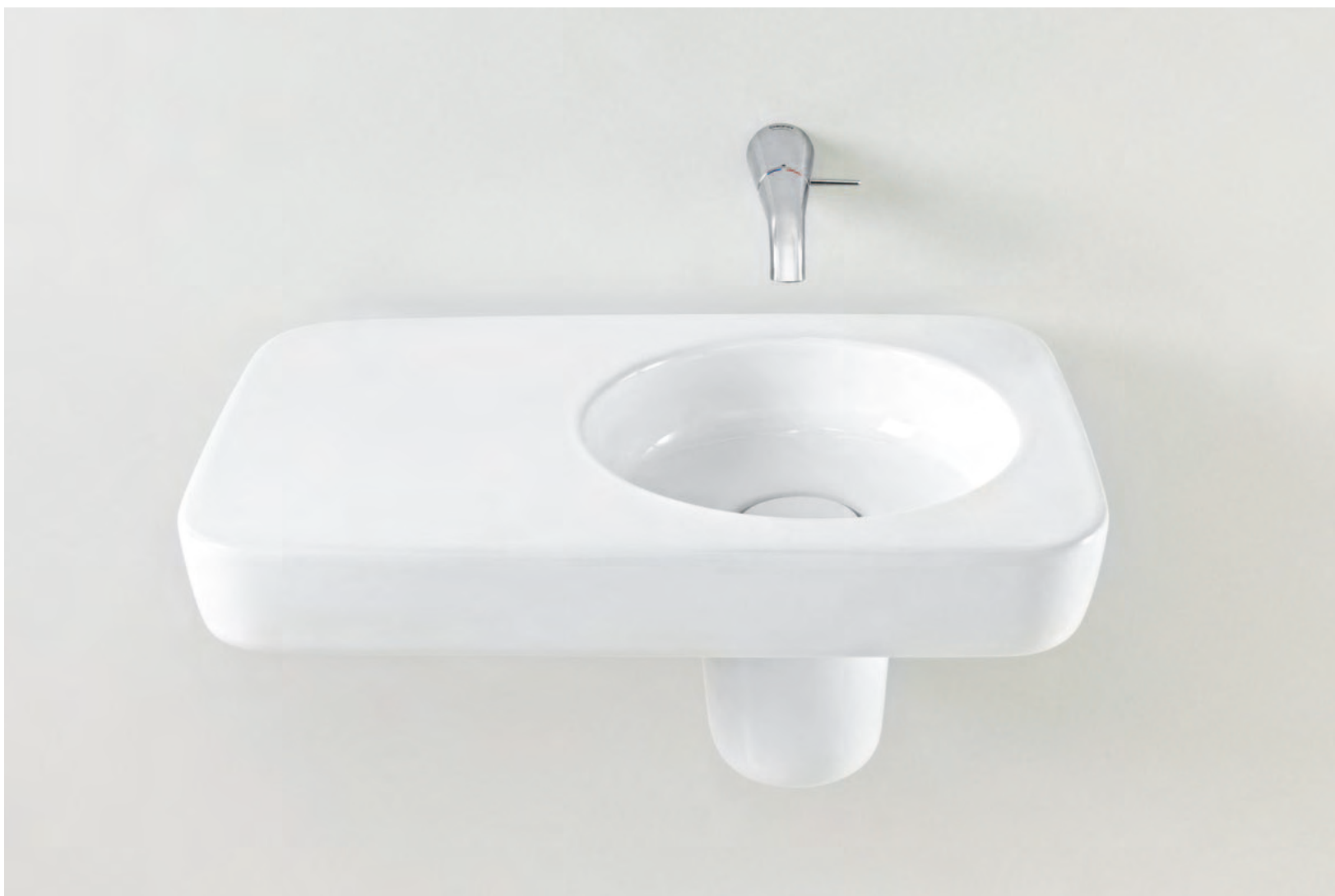
wall basin mixer CMN92001C5A wall basin left hand shelf CMN869500W shroud CMN869350W wall basin right hand shelf CMN869400W