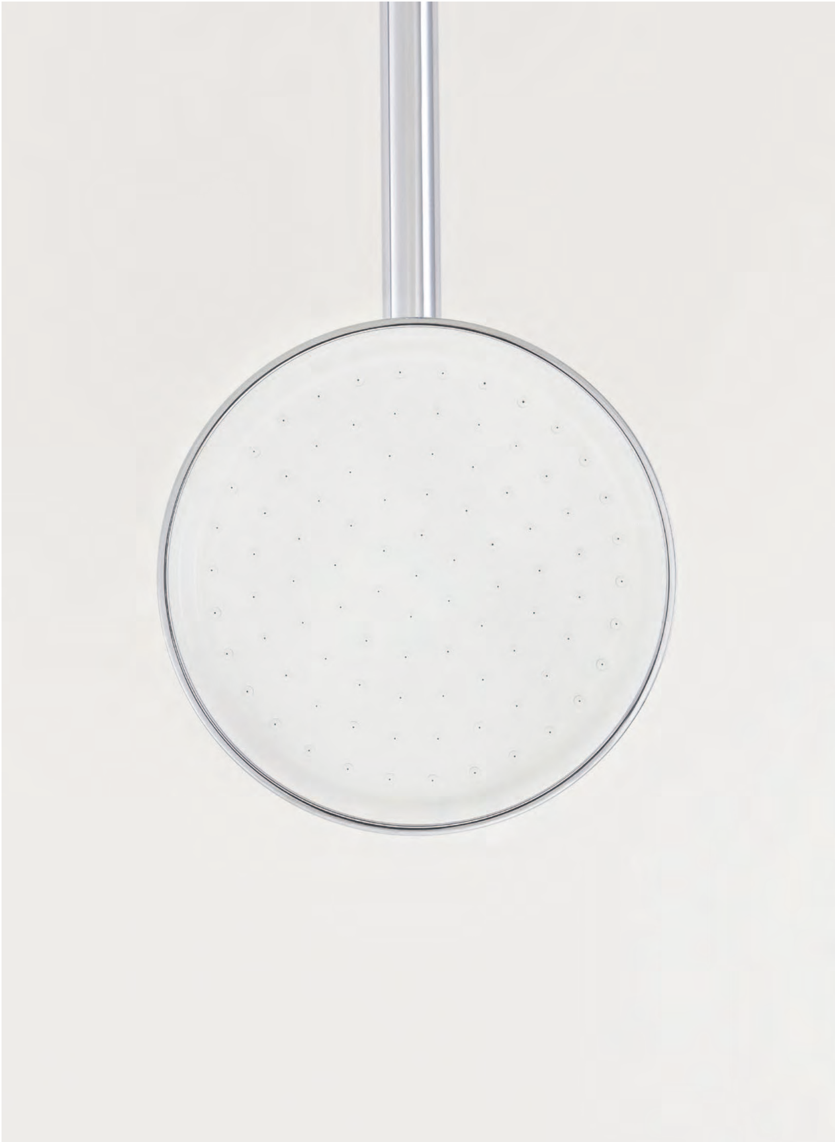
fixed wall overhead shower CMN92005CW3A also available in chrome-orange and chrome-black