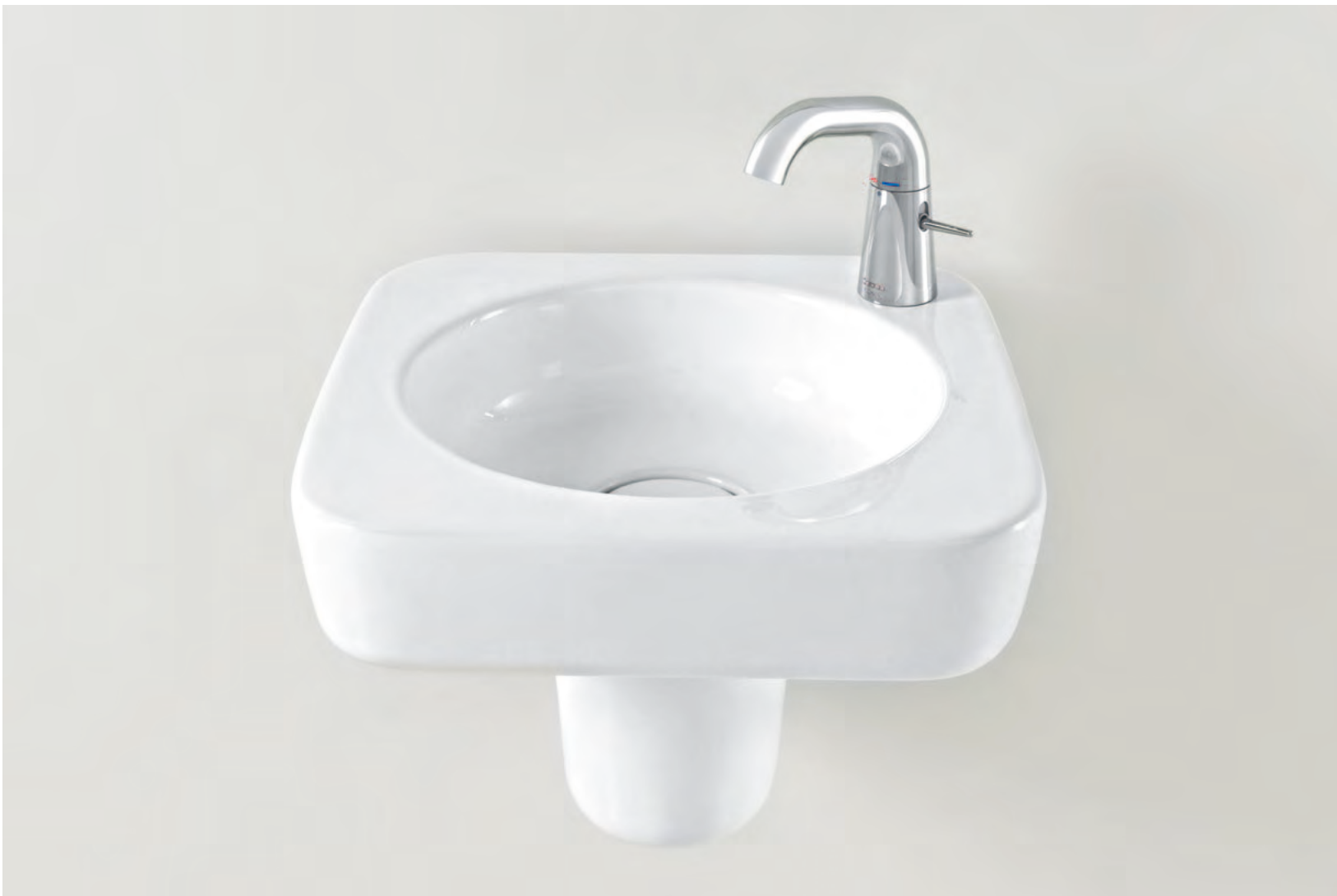
above counter basin CMN895010W basin mixer CMN92000C5A wall basin CMN869310W shroud CMN869350W