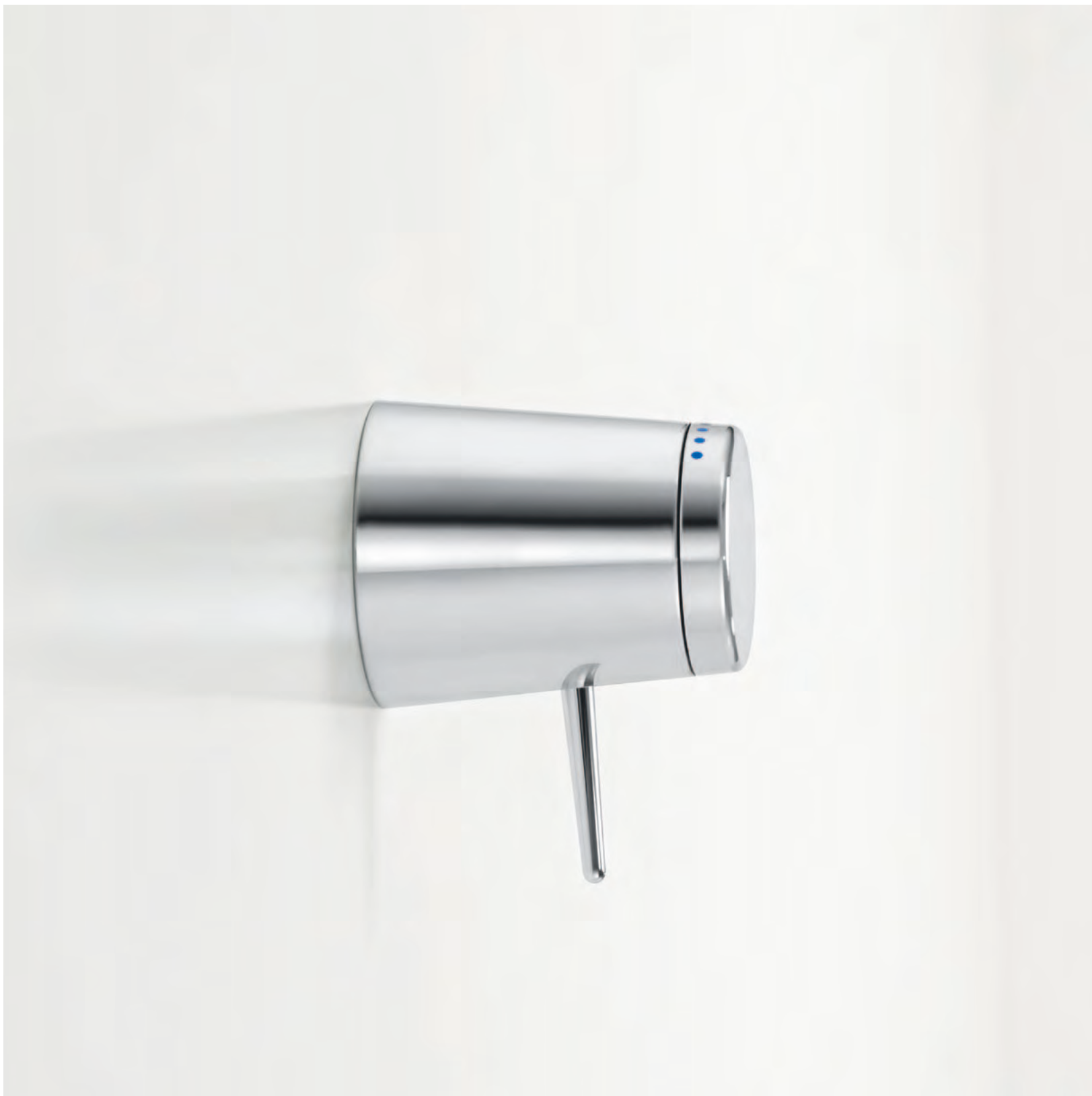
rail shower with overhead CMN92008C3A shower mixer CMN92003C also available in chrome-white and chrome-black