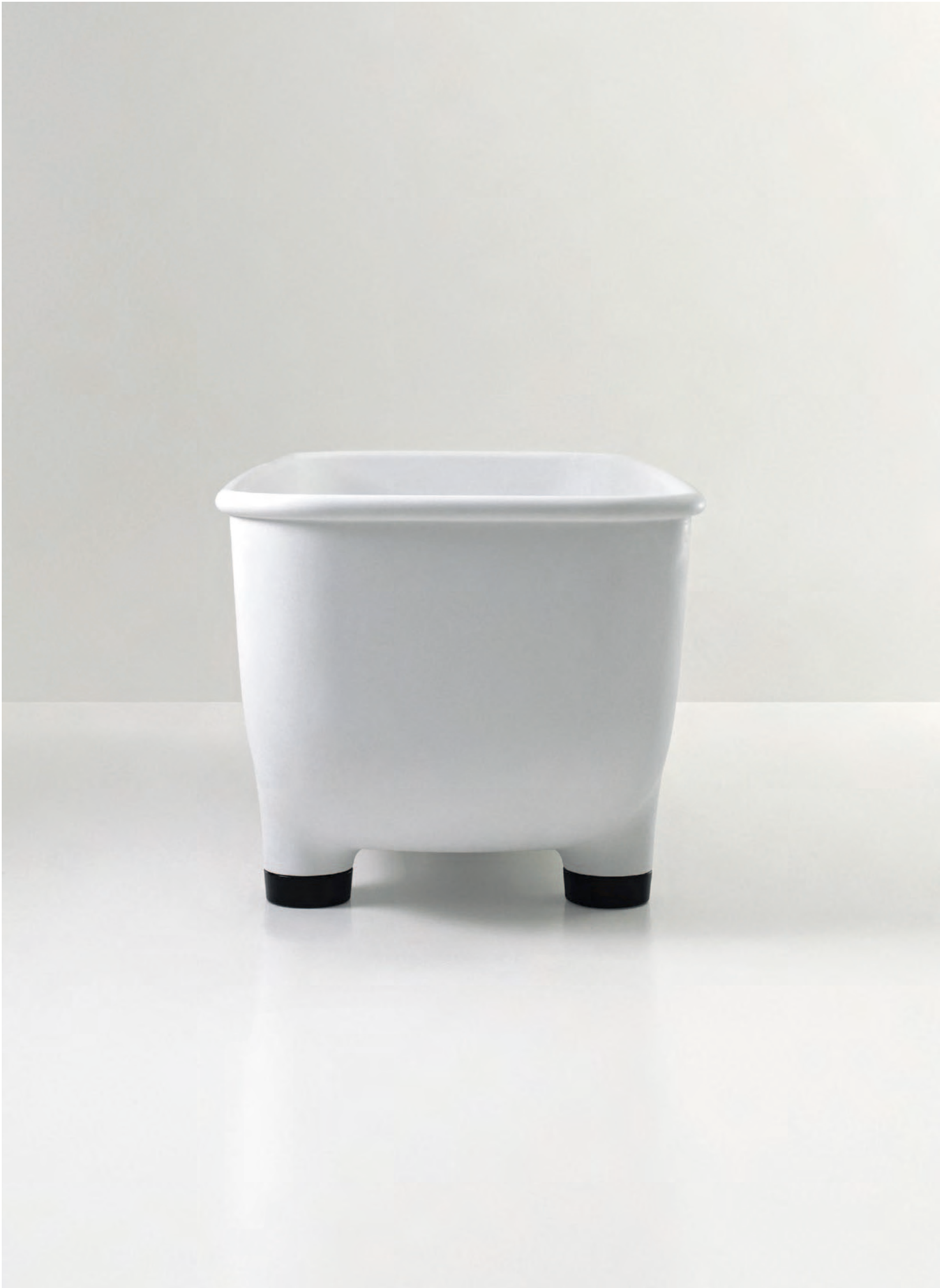
freestanding bath CMN8W freestanding bath filler CMN92010C