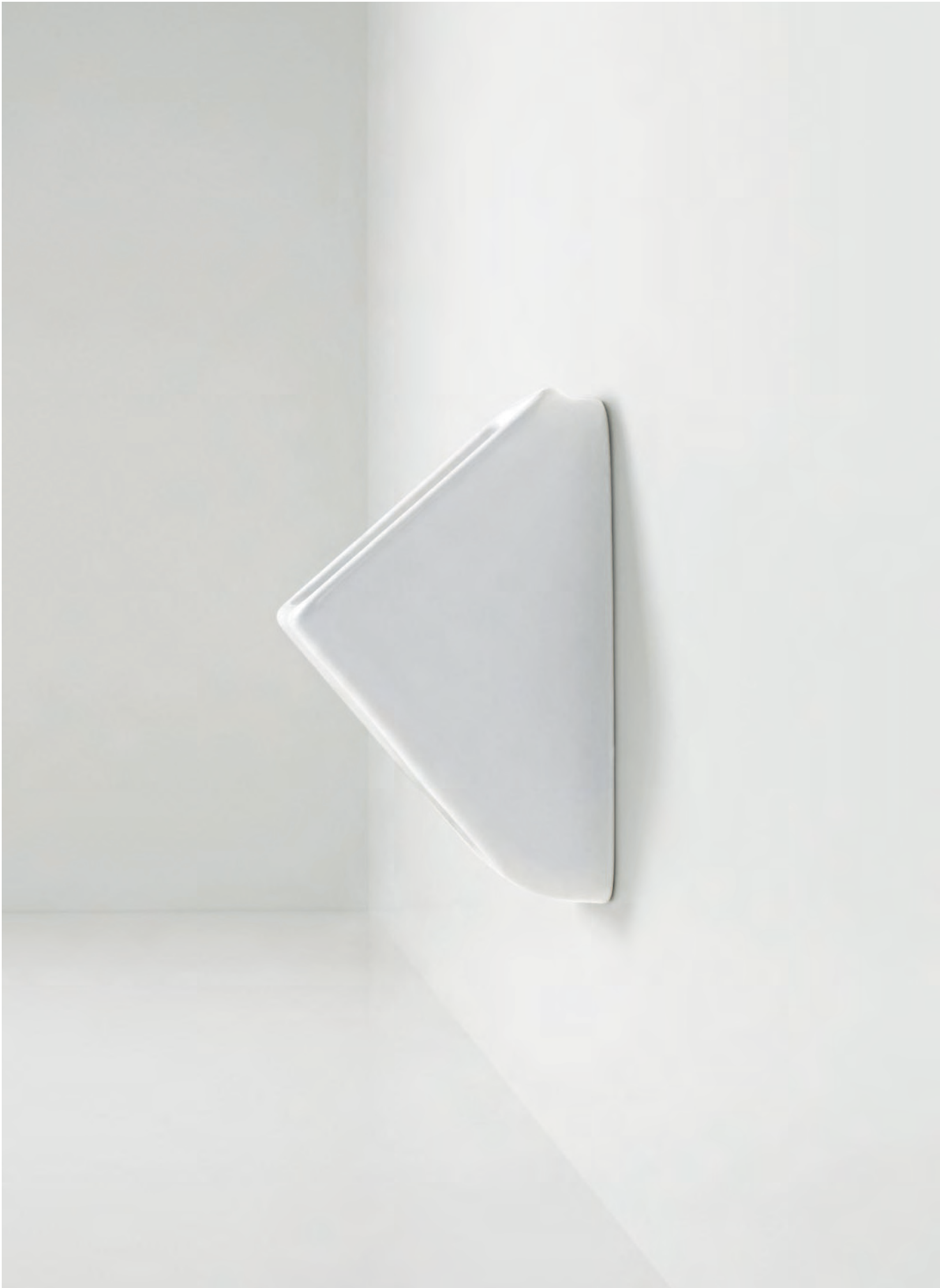
wall faced Invisi II™ toilet suite CMN775100W wall hung Invisi II™ toilet suite CMN775200W electronic urinal suite 678661