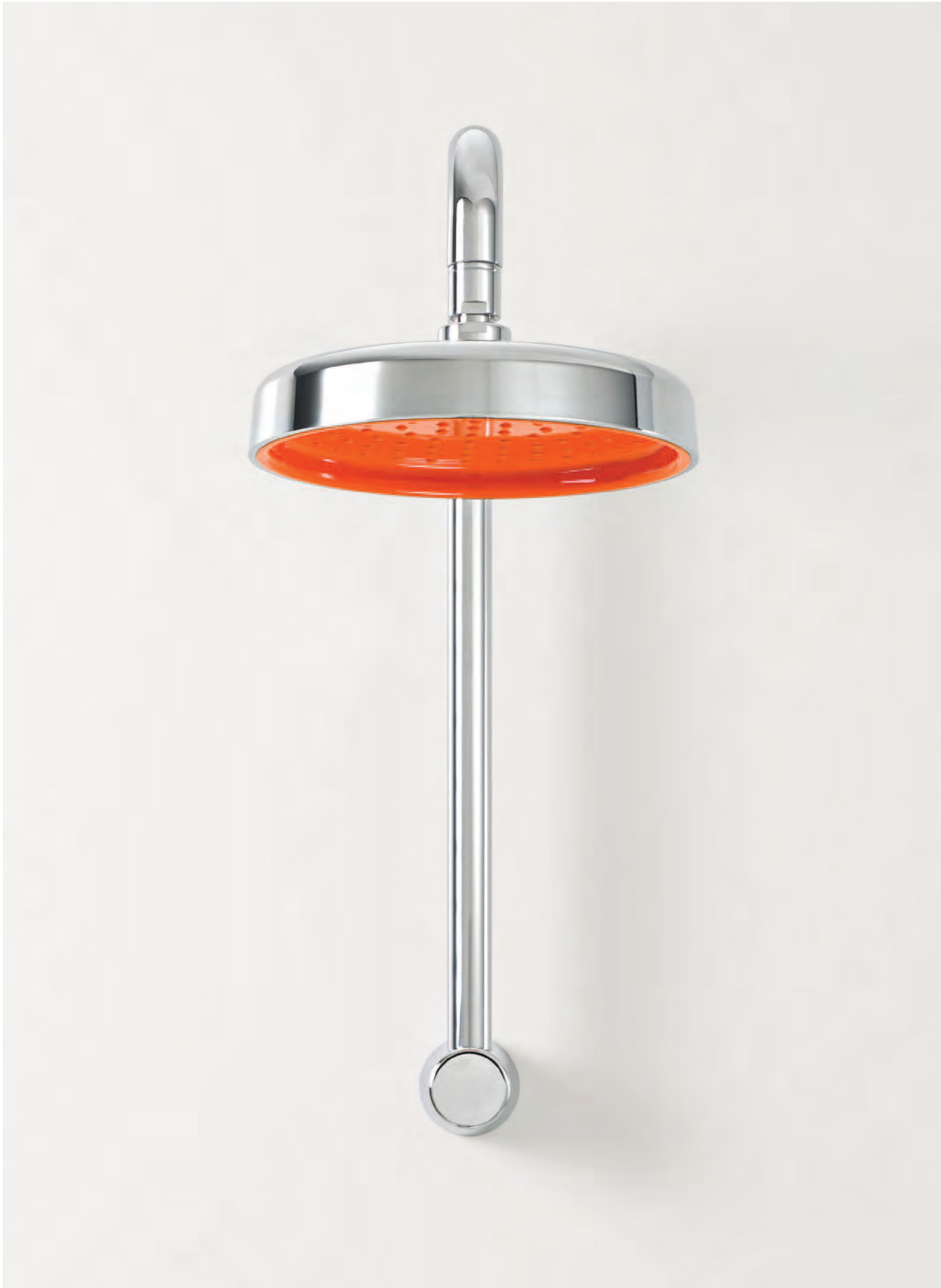
fixed wall overhead shower CMN92005C3A also available in chrome-white and chrome-black