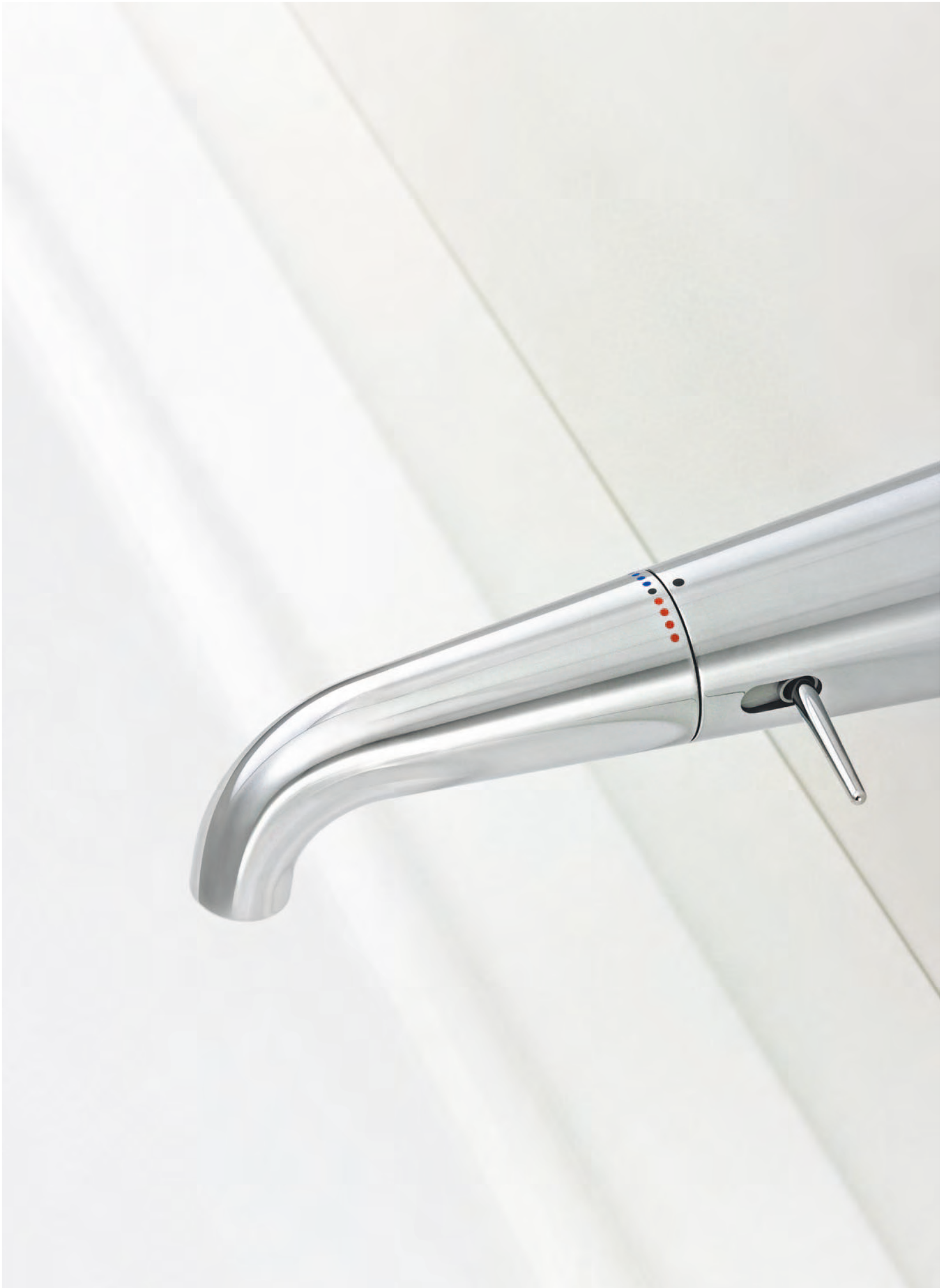
wall bath mixer CMN92002C