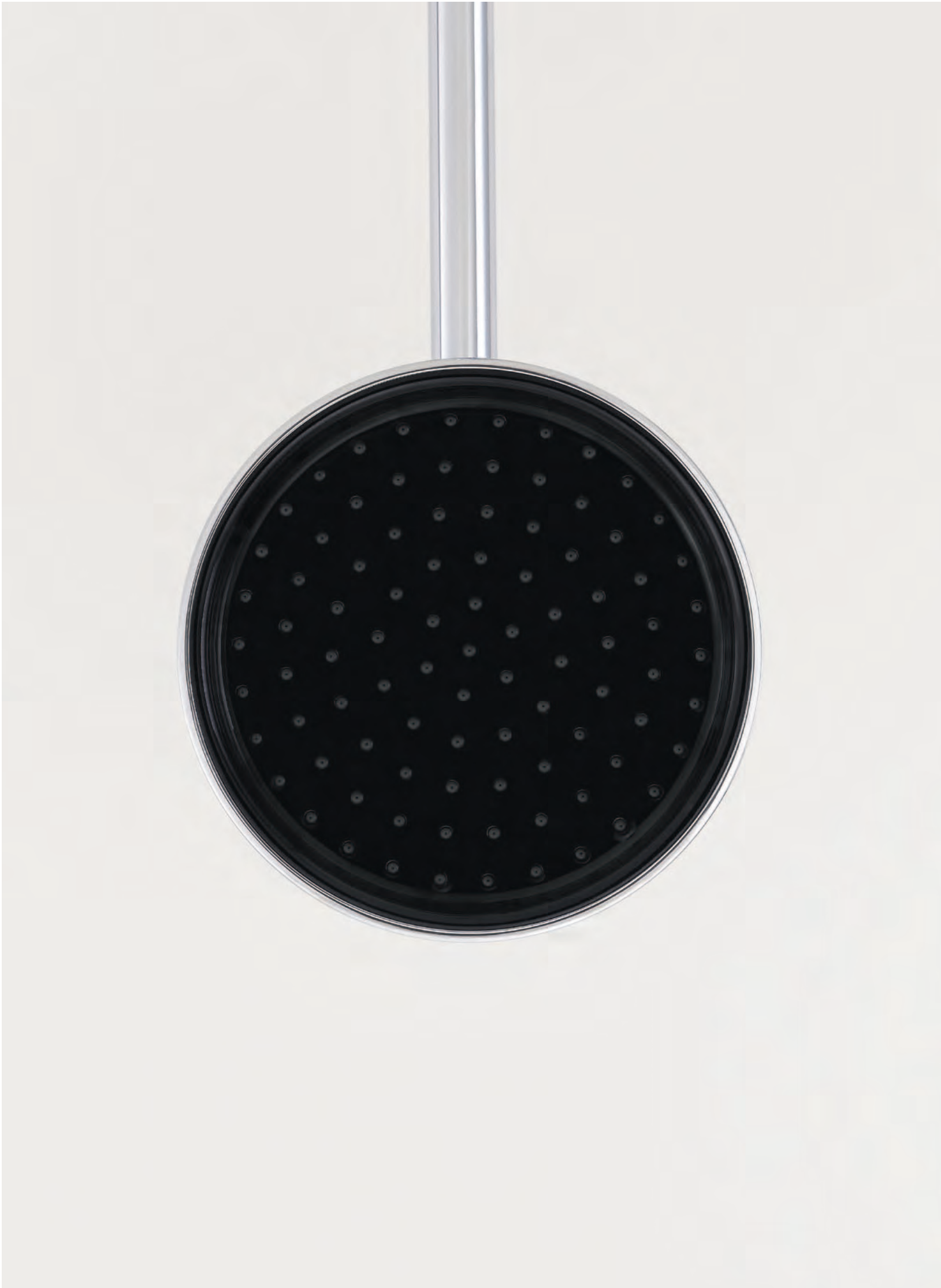
fixed wall overhead shower CMN92005CB3A also available in chrome-orange and chrome-white