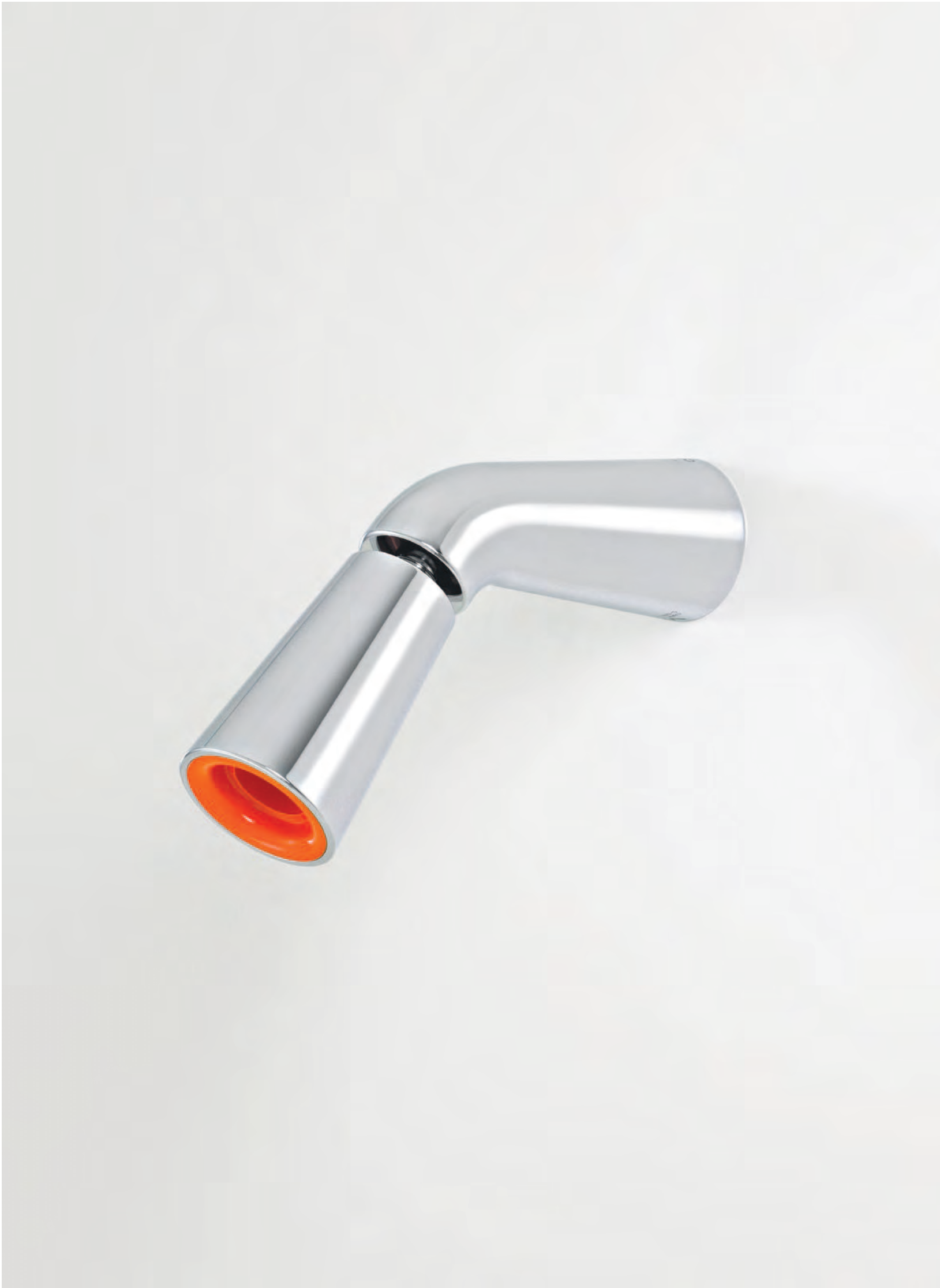
fixed wall shower CMN92004C3A hand shower CMN92006C3A also available in chrome-white and chrome-black