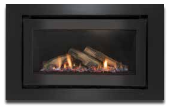
Black on Black with Australian Eucalyptus Logs

*When installed using extended flue **When using short flue